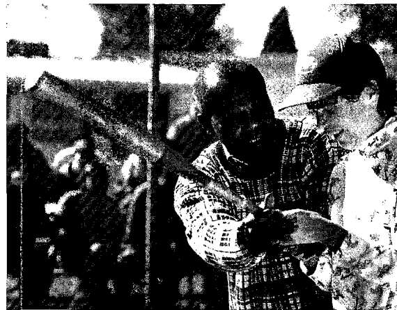
Specially trained and certified counselors provide participants with opportunities for physical development, relaxation and play.