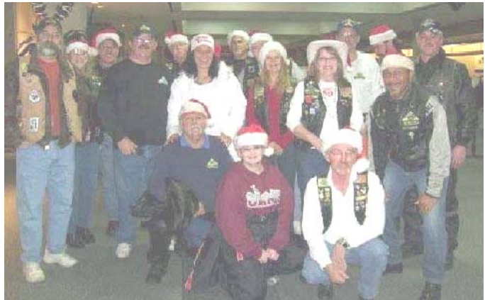
The Patriot Guard Riders at Norfolk Airport