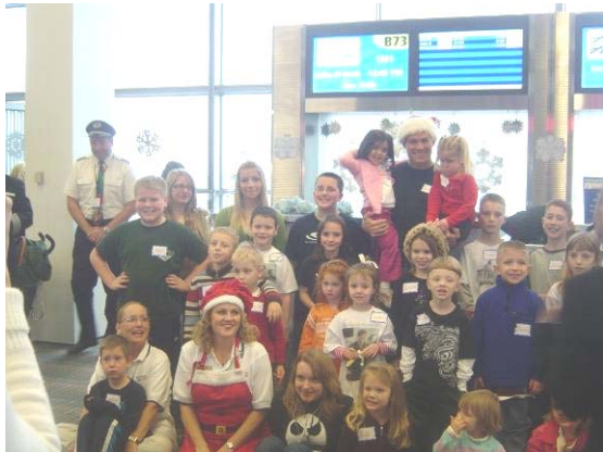
The Departure from Dulles Airport